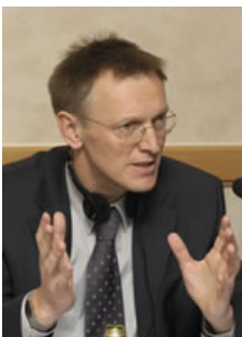
Janez Potočnik Commissioner for Science and Research

When reading this you probably realise that complementary medicine will not have a major role in this programme. A minor role in terms of a small part of the health budget may be a possibility. Indeed, for the first reading of the Commission proposal in the European Parliament an amendment on the use and the potential benefit of Complementary and Alternative Medicine has been tabled by the German MEP Mrs. Dagmar Roth-Behrendt. If this amendment is accepted it will be possible to introduce CAM research projects for funding by the European Union. (See the amendment in the box)