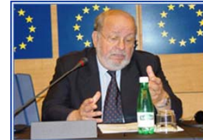
Antonios Trakatellis MEP, Greece

We know from the ‘Kondratieff Waves’ that health will have the highest priority for the citizens during the first decades of the 21 st century. The high expectations of the EU-citizen in regard to health and healthcare aimed at national and European decision makers has been recognised by the European Parliament: Healthcare is an extremely important topic, a daily concern for the citizen, who is waiting for the European Union to become more ambitious and active in this field; MEPs are convinced that an effective and successful EU-health policy could bring the institutions closer to the people and could give the European more credibility.