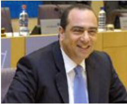
Markos Kyprianou Commissioner for Health and Consumer Protection

The major aim of the EU-Health Programme is to promote (by means of studies, surveys and campaigns) a healthy life-style, to protect citizens against threats to health, to make national healthcare systems more efficient and finally to assure EU-wide accessibility to good healthcare for all citizens. These last two points are not supported by the Council which argues that this is covered by the health policy of the individual Member States.