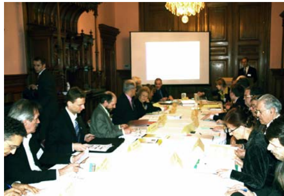
European Associations representing the patients using CAM, doctors and practitioners