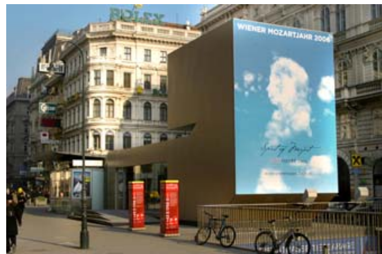
250th birthday of Mozart

(EVR) On April 25 th , the Annual Membership Assembly of ECHAMP will take place.