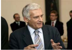
Jerzy Buzek MEP, Poland

Information can be found on the website: http://europa.eu.int/comm/research/index_en.cfm