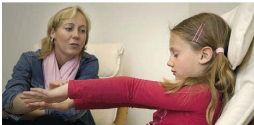
St. Antonius Hospital in Nieuwegein, NL

600 parents visiting the hospital with their children were requested to anonymously complete a questionnaire about their use of alternative medicine.